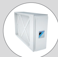
DAIKIN ONE AIR CLEANER