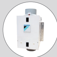
DAIKIN ONE POWERED VENTILATOR