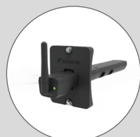
DAIKIN ONE HOME AIR MONITOR