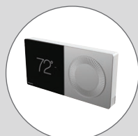
DAIKIN ONE+ SMART THERMOSTAT