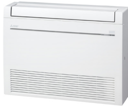
Indoor Unit: MFZ-KJ12NA-U1