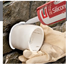
Caulk wall opening.