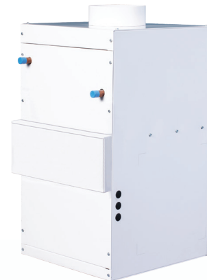
HE-Z Series Fan Coil

Energy Saving Products Ltd. is introducing the HE-Z Series of fan coils. This innovative product will feature our newly developed PSB (Pressure Sensing Board) motor controller, which is a combination of our standard board (in use for 8 years) and our PWM controller (5 years), which will utilize many of our past features while adding some new (see page 2). Packaging the new PSB together with a Variable Frequency Drive manufactured by the WEG Electric Corporation, the HE-Z series will become your ultimate choice in a multi-functional fan coil. This move will take the former EPC control board and EPC circuit board out of the product line.