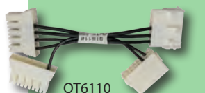
QT6110 QwikConnect™ ECM Adapter is useful for replacing ECM 2.3 or Eon Motors in fan coil units to Evergreen® CM or EM motors.