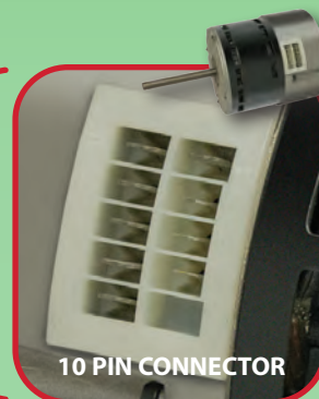
10 PIN CONNECTOR