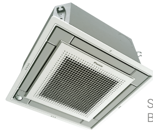
Shown with panel BYFQ60C2W1S