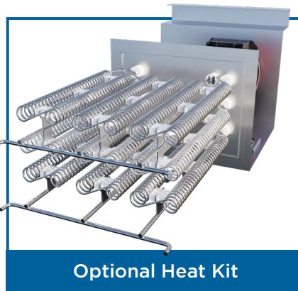
Optional Heat Kit