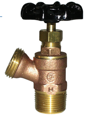
Pictured Model T/S-521