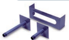
Straight Stubs & Stub Bracket