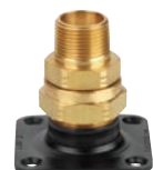
Termination Fitting with Square Flange