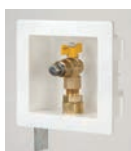
XR3 Outlet Box