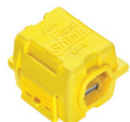
Jacket Stripper Tool