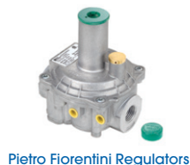
Pietro Fiorentini Regulators