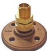
Termination Fitting with Bronze Flange