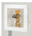
XR3 Outlet Box