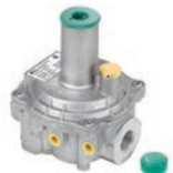
Pietro Fiorentini Regulators