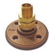
Termination Fitting with Bronze Flange