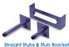
Straight Stubs & Stub Bracket