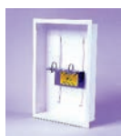
Gas Load Center