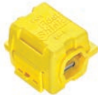
Jacket Stripping Tool