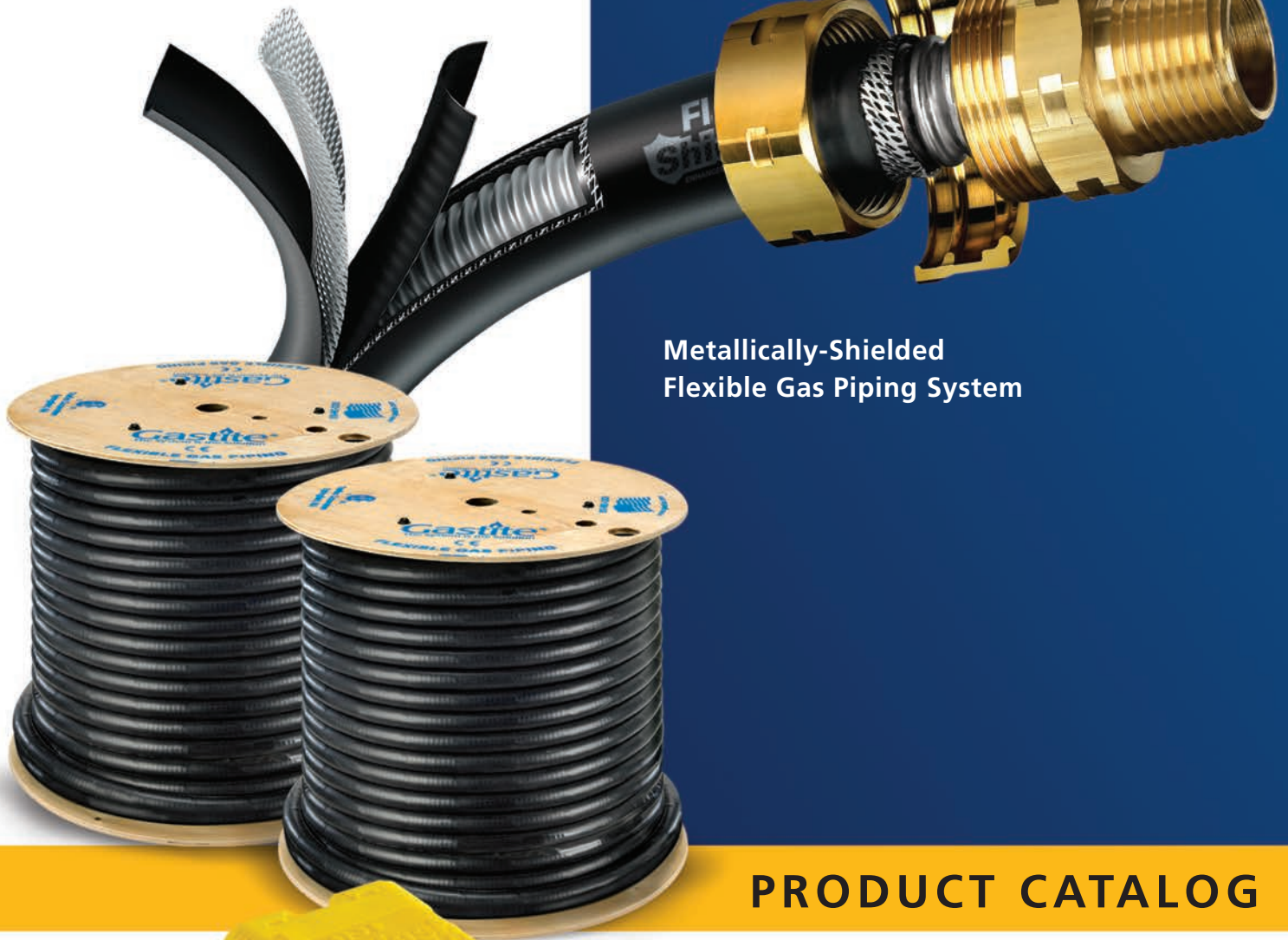
Metallically-Shielded Flexible Gas Piping System