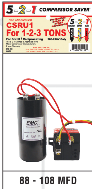
CSRU1 For 1-2-3 Tons For Scroll/Reciprocating