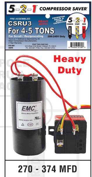
CSRU3 For 4-5 Tons For Scroll/Reciprocating

The 5-2-1® Compressor Saver® has been pre-wired for your convenience. There are only 3 color coded wires which need to be connected. The Black wire will be connected to the Common side of the compressor. The Striped wire will be connected to the Start winding of the compressor and the Red wire will be connected to the Run winding of the compressor. Remember-5,2,1=Common, Start, Run.