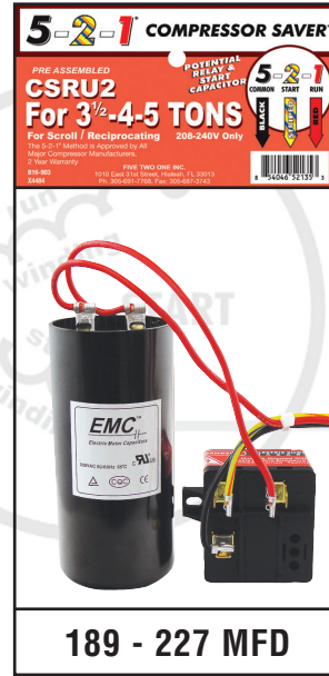
CSRU2 For 3 1/2-4-5 Tons For Scroll/Reciprocating