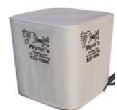
Custom Printed Covers