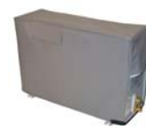
Ductless Split Covers