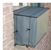
Window Unit Covers