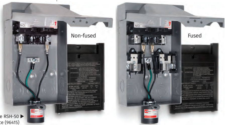
All DB models include RSH-50 ▶ surge protection device (96415)

Application • Wall mount installation of RSH-50 (above) Recommended for • Residential and commercial use • All single phase 120/240 VAC outside condensing units and indoor air handlers.