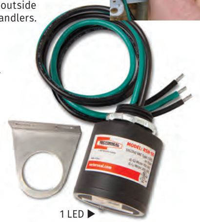
1 LED ▶

Application • Protect HVAC equipment from electrical surges, brownouts, and other voltage disturbances • Protects from up to 50,000-amp single surges and up to 10,000-amp repetitive surges • Type 1 Device - can be mounted in any position Recommended for • Residential and commercial use • All single phase 120/240 VAC outside condensing units and indoor air handlers. Specifications Operating Voltage - 120/240VAC Max discharge current per phase - 50kA (1 hit) Normal discharge current - 10kA (15 hits) Short circuit current - 200kA