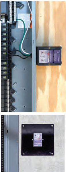
96422 Metal Flush Mount Plates Also fits RSH-60

Specifications Operating Voltage - 120/240VAC Max discharge current per phase - 120kA (1 hit) Normal discharge current - 20kA (15 hits) Short circuit current - 200kA