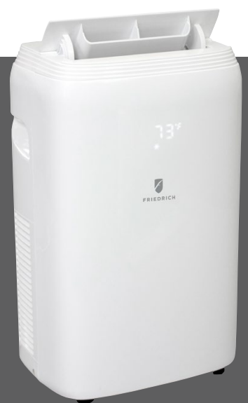
ZCP08SA, ZCP10SA, ZCP12SA