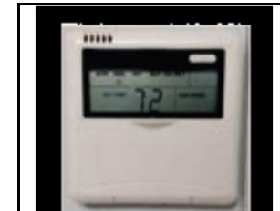
Optional WCM1 Wall Control for 9-36K 16-19 SEER Single Zone Systems