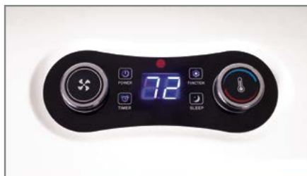
Controls feature large LED display and rotary dial fan and temperature adjustment