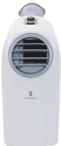
P08SA, P10SA, P12SA

You can quickly set up supplemental or emergency cooling for computer rooms.