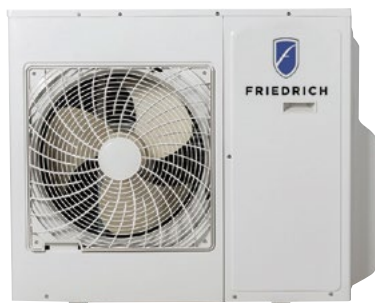
FPHMR18A3A , FPHMR24A3A