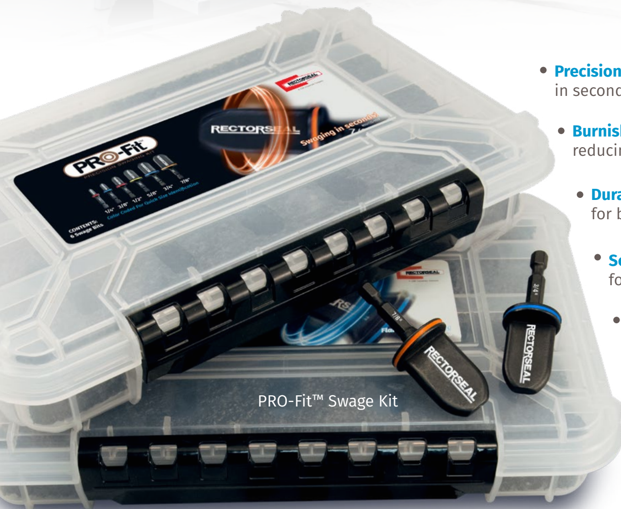
PRO-Fit™ Swage Kit