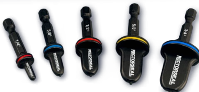
PRO-Fit™ Flare Kit