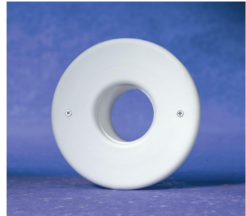
Figure 1. Supply Outlet (UPC-56B)

The outlets can be placed in the ceiling, floor or wall. The best place for ceiling outlets is the corner – center the hole 5 inches (125 mm) from each wall. If that is not possible or practical, anywhere out of the traffic pattern is acceptable. Be sure an outlet screen (UPC-88) is installed to prevent objects from falling into the duct when used in floor applications. This screen is included with the UPC-57 unfinished wood outlet.