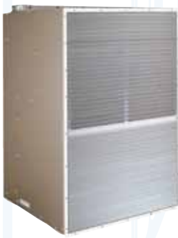
Comfort Pack Architectural Louver Grille (shown in anodized aluminum)

Our louver grilles enhance the appearance of the building, while providing protection from the weather and possible vandalism. Grilles are available in anodized aluminum and in multiple colors.