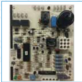
New Control Board