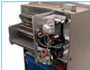
95% Thermal Efficiency, Slide-Out Furnace with Stainless Steel Heat Exchanger