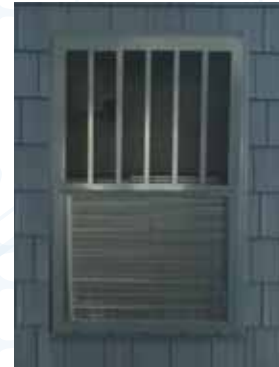
Comfort Pack Powder Coated Stamped Louver