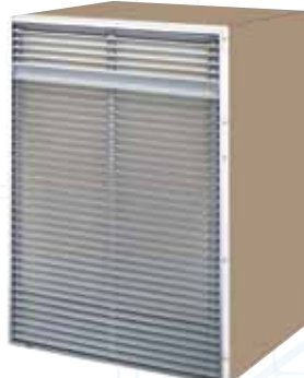
Split-System Architectural Louver Grille (shown in anodized aluminum)