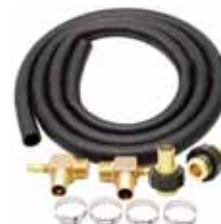
Hose Kit AHK5EC