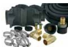
Hose Kit AHK5PE