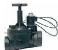
Plastic Solenoid Valve - AVSP5