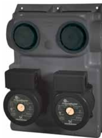
Flow Controller Double O-Ring Connections