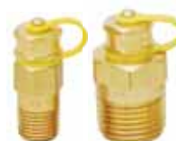
P/T Plug 70022002 & 70022003