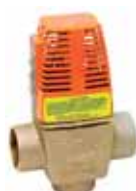
Brass Motorized Valve - AVMB5