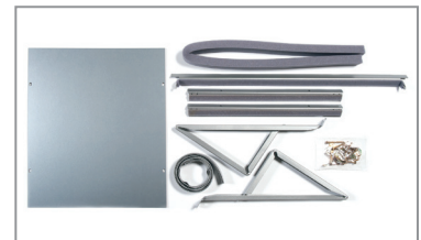
KWIKSB, KWIKMB, KWIKLB