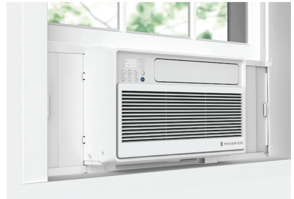
Rigid, Expandable Side Panels