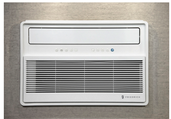
Models CCV15, CCV18, CCV24 can be installed in a wall or window