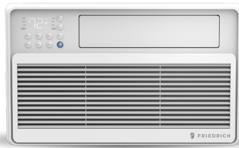
WINDOW INSTALLATION ONLY CCV08, CCV10, CCV12