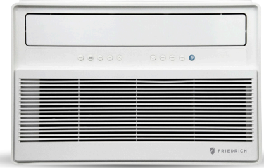
WINDOW OR THRU-WALL INSTALLATION CCV15, CCV18, CCV24