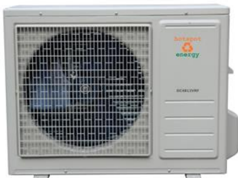
ODU (Outdoor Unit)

Variable Refrigerant Flow & Capacity means that the air conditioner is always the right size for the conditions and is never wasting power.