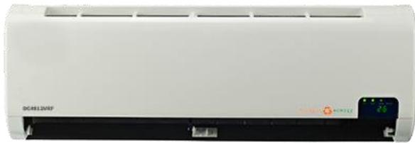
Wall Mount Indoor Unit (IDU)

12,000 BTU 48V DC Heat Pump VRF Dynamic Capacity Compressor 100% DC - No Inverter