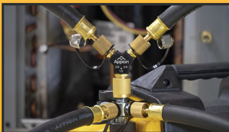
* Extra MH12000EAK hoses sold separately

Learn More At www.AppionTools.com/SPDKITV