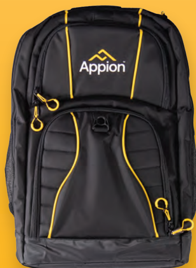
The SPDKIT-V includes the New Appion MegaFlow Tool Bag