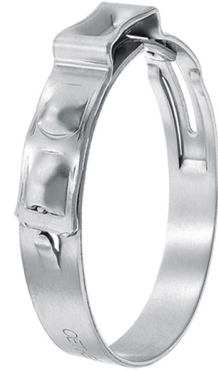
Pictured: SS Cinch Ring