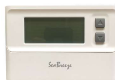
435-0025 SN11I Non-Programmable HC Thermostat