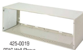
425-0019 PTAC Wall Sleeve