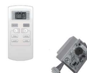
425-0057 PTAC Remote for ZC and VC Models