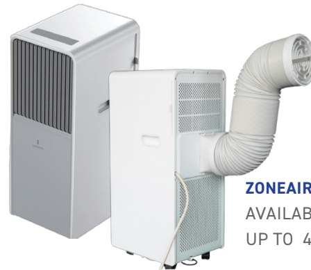
ZONEAIRE® COMPACT AVAILABLE FOR SPACES UP TO 450 SQ FT.*