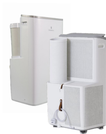
ZONEAIRE® SELECT AVAILABLE FOR SPACES 550 SQ FT.*