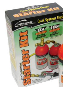
Qwik-SF 1lb. P/N QT1130