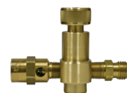
Qwik-SF Can Access Valve with Built-In Pressure Relief Valve P/N QT1105