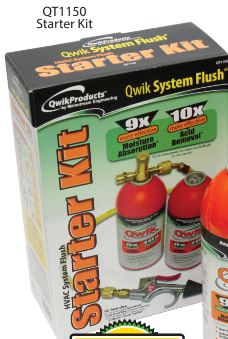
QT1150 Starter Kit