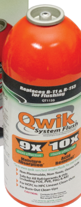
QT1130 1lb Can

The original Qwik System Flush was developed by Mainstream Engineering Corporation for the U.S. Air Force in 2001. EPA regulations brought about the need to find alternatives for the R-11 & R-113 flushing agents originally used to clean the pilot's oxygen breathing systems. Qwik-SF® was developed as a superior, non-toxic flushing agent with no long-term environmental or health risks.