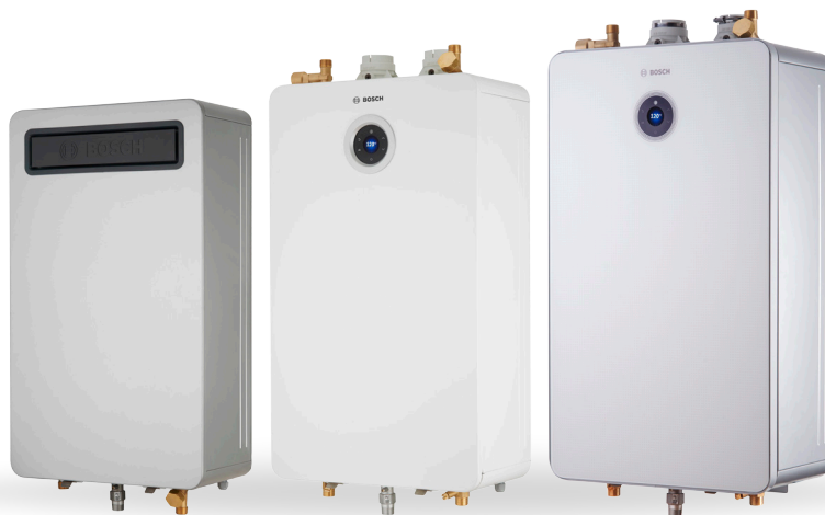
Greentherm T9800 SE outdoor