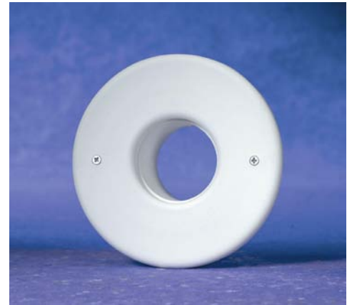
Figure 1. Supply Outlet (UPC-56B)

The outlets can be placed in the ceiling, floor or wall. The best place for ceiling outlets is the corner – center the hole 5 inches (125 mm) from each wall. If that is not possible or practical, anywhere out of the traffic pattern is acceptable. Be sure an outlet screen (UPC-88) is installed to prevent objects from falling into the duct when used in floor applications. This screen is included with the UPC-57 unfinished wood outlet.