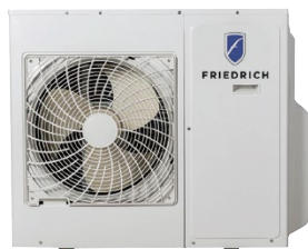
FPHMR18A3A , FPHMR24A3A